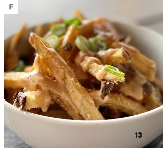
A, B: Stop by The Pass Beer Co. in Blairmore for some delicious pizza, snacks and craft beer.